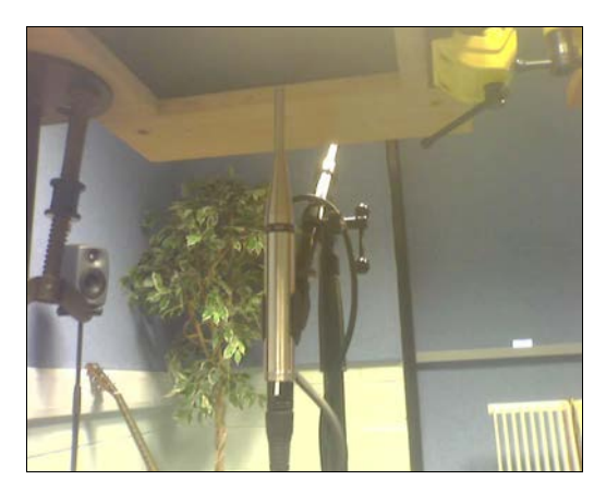
Figure 5 - Microphone Position, under CFRP

Table 3 below details the common frequencies found in both the experimental data and simulated data which, for this initial study proves to be great results.